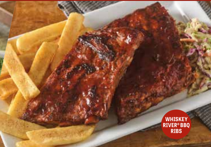
WHISKEY RIVER ® BBQ RIBS