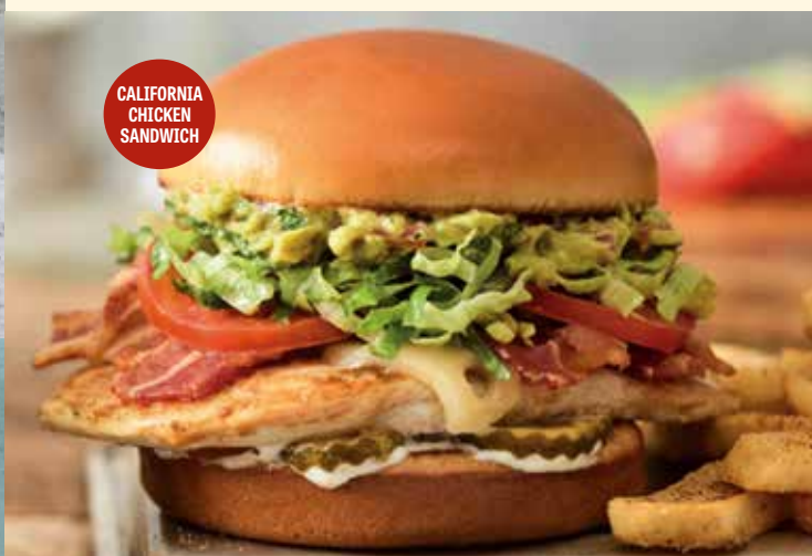
CALIFORNIA CHICKEN SANDWICH

Simply perfect! This new, improved recipe features hand-breaded chicken breast fried golden brown and served with pickles, lettuce, tomato and mayo. 14.29 cal 910