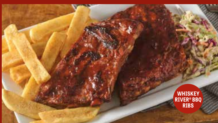
WHISKEY RIVER® BBQ RIBS

A half rack of tender St. Louis-style pork ribs glazed with Whiskey River® BBQ Sauce. Served with coleslaw and your choice of Bottomless side. 18.49 cal 1720-2190