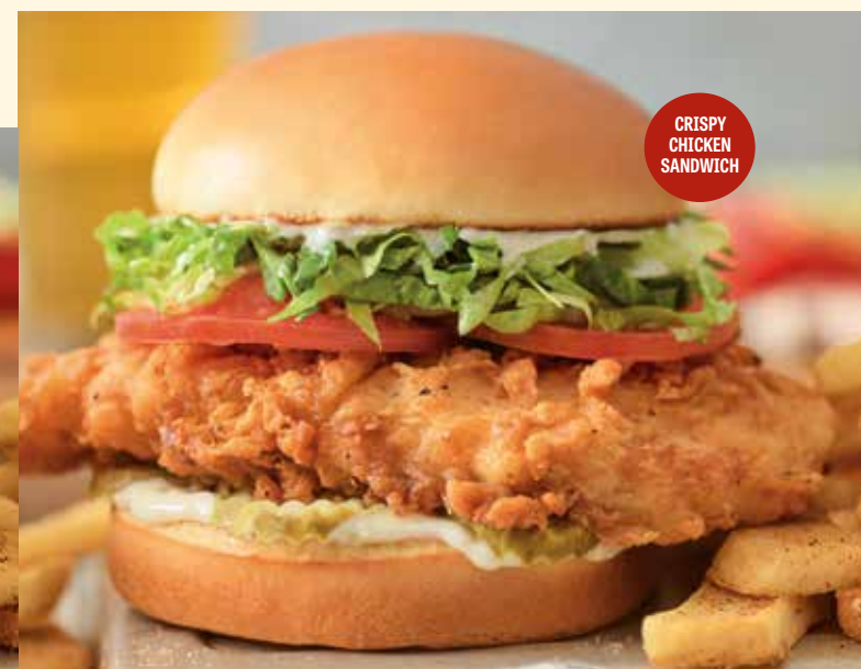
CRISPY CHICKEN SANDWICH