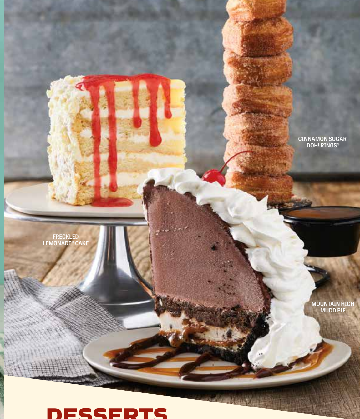
FRECKLED LEMONADE® CAKE

2,000 calories a day is used for general nutrition advice, but calorie needs vary.