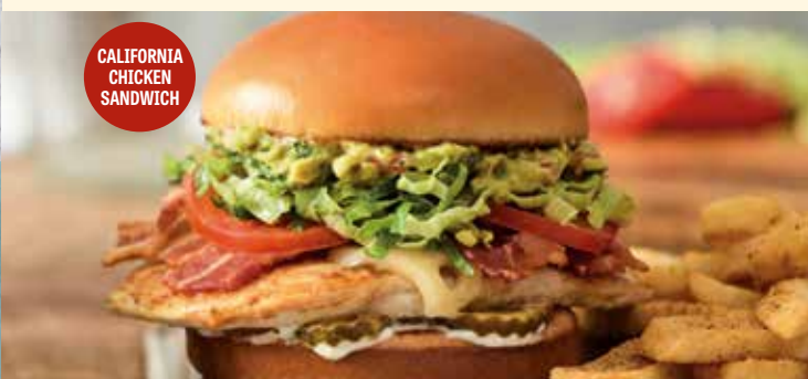
CALIFORNIA CHICKEN SANDWICH

Pickles, lettuce, tomato and onion on the side. 12.99 cal 350