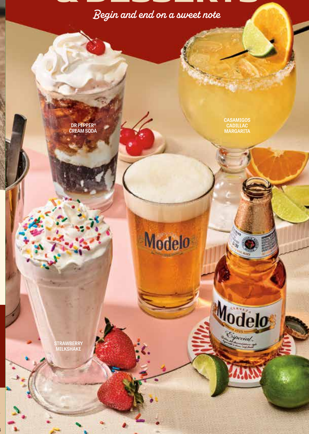
DR PEPPER® CREAM SODA