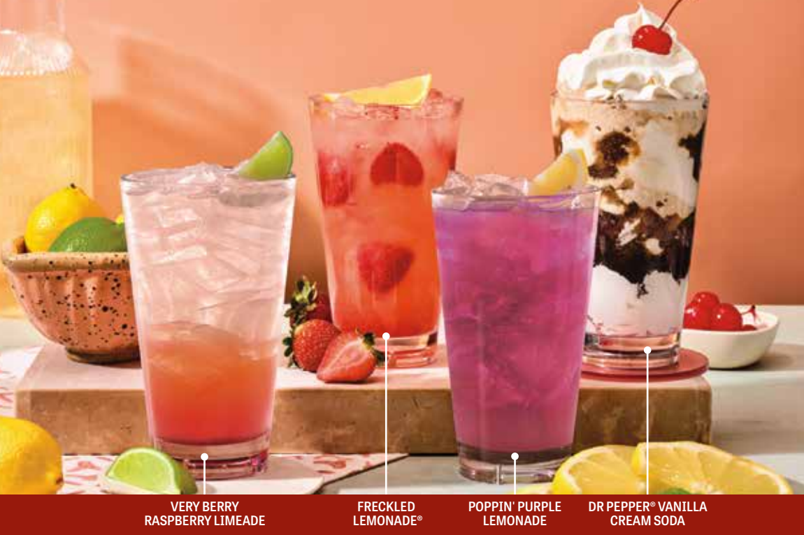
VERY BERRY RASPBERRY LIMEADE