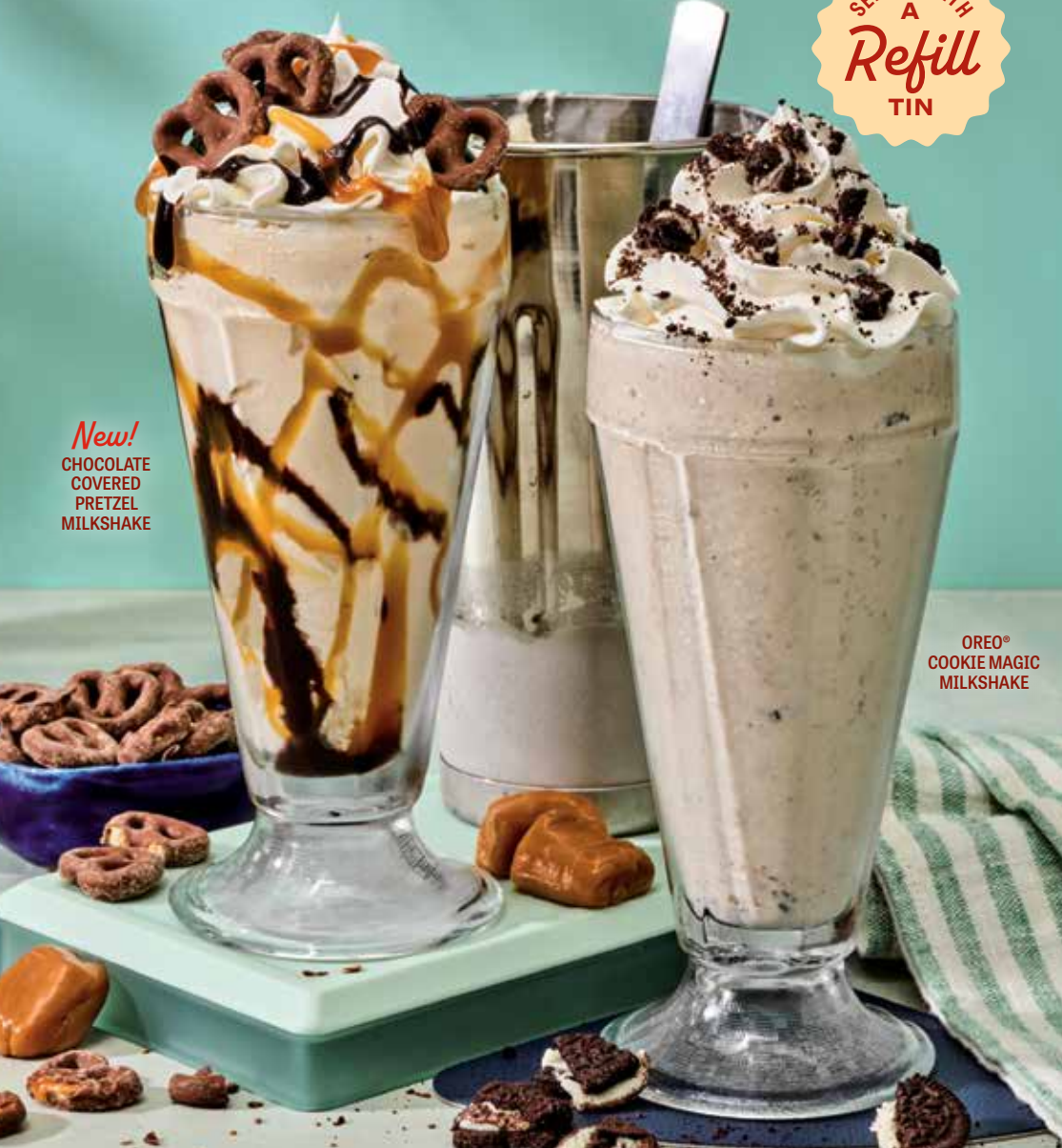
OREO® COOKIE MAGIC MILKSHAKE

New! CHOCOLATE COVERED PRETZEL MILKSHAKE