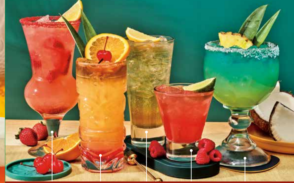
SPIKED FRECKLED LEMONADE®

2,000 calories a day is used for general nutrition advice, but calorie needs vary.