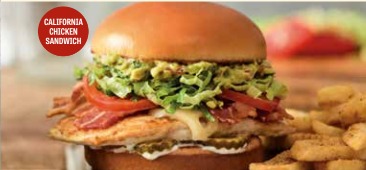
CALIFORNIA CHICKEN SANDWICH

Sliced chicken breast, Parmesan, romaine, tomato and Caesar dressing in a flour tortilla. 13.49 cal 840