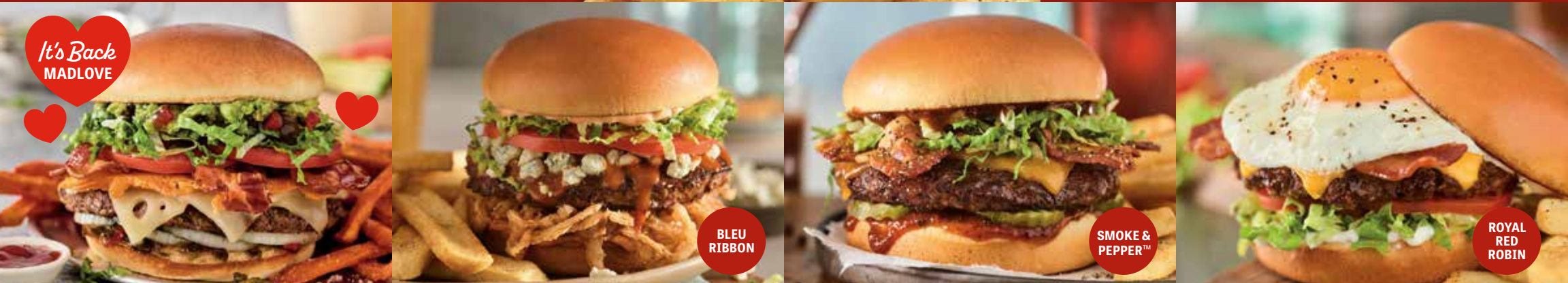
It's Back MADLOVE