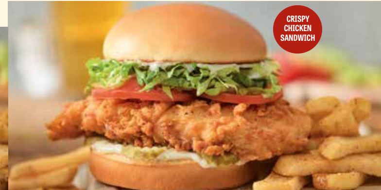
CRISPY CHICKEN SANDWICH