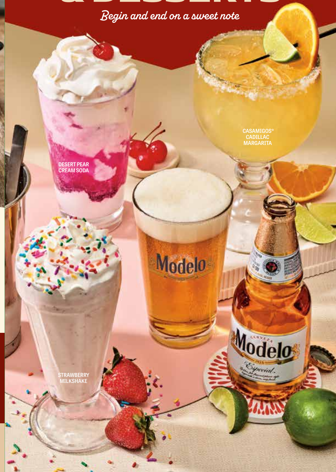
DESERT PEAR CREAM SODA