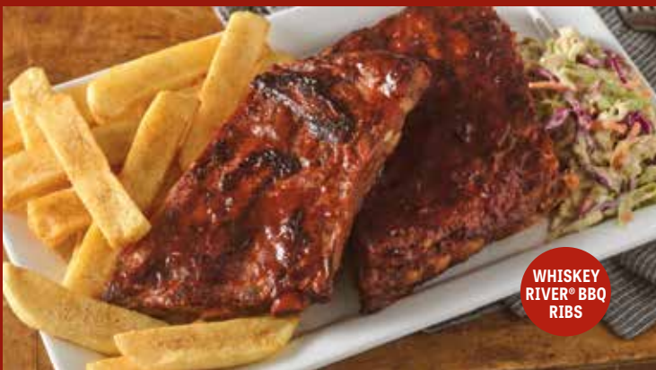
WHISKEY RIVER® BBQ RIBS

A half rack of tender St. Louis-style pork ribs glazed with Whiskey River® BBQ Sauce. Served with coleslaw and your choice of Bottomless side. 17.99 cal 1720-2190