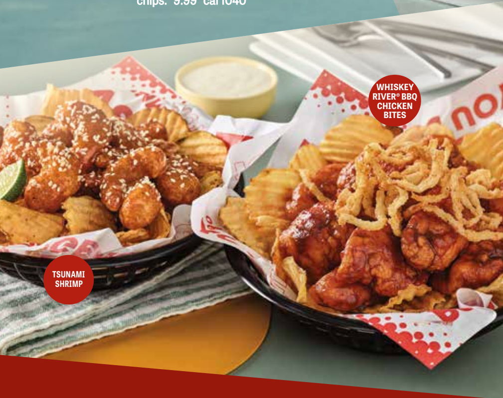
WHISKEY RIVER® BBQ CHICKEN BITES

Our signature queso made in-house with spicy chorizo, fresh-grilled poblanos, cilantro and a pile of tortilla chips. 9.99 cal 1040