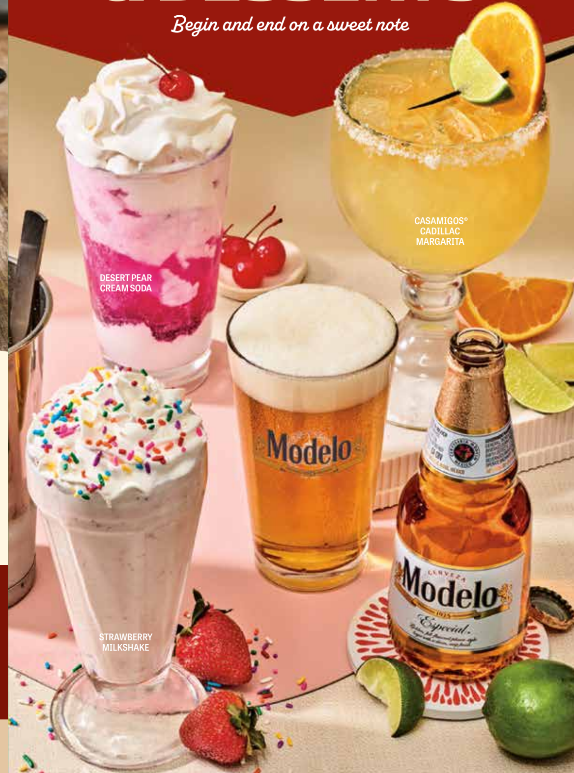
DESERT PEAR CREAM SODA