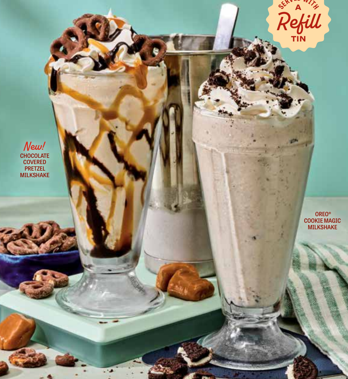
OREO® COOKIE MAGIC MILKSHAKE

New! CHOCOLATE COVERED PRETZEL MILKSHAKE