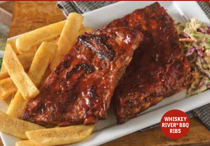
WHISKEY RIVER ® BBQ RIBS