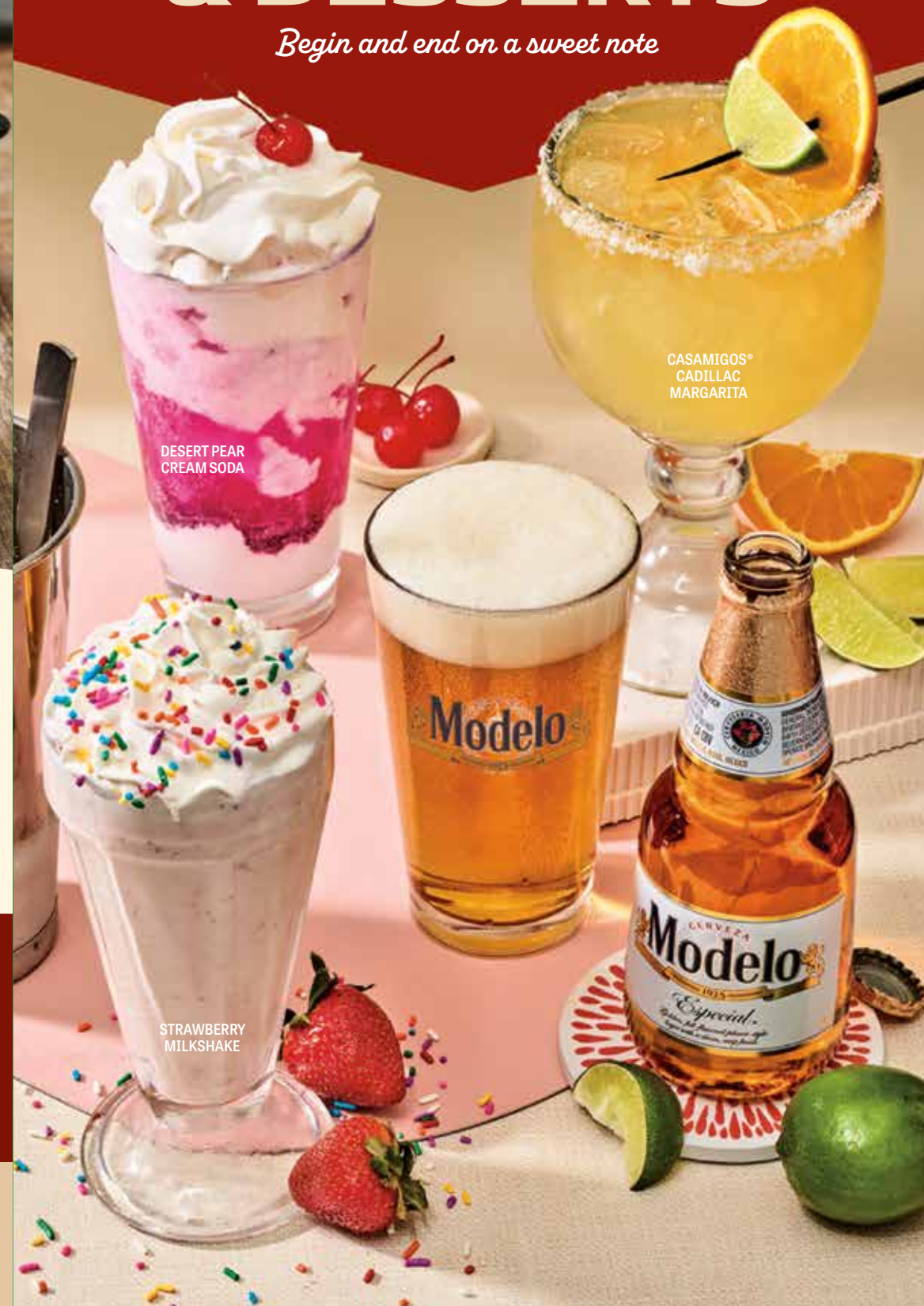
DESERT PEAR CREAM SODA