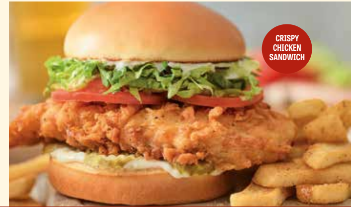
CRISPY CHICKEN SANDWICH

Simply perfect! This new, improved recipe features hand-breaded chicken breast fried golden brown and served with pickles, lettuce, tomato and mayo. 15.19 cal 910