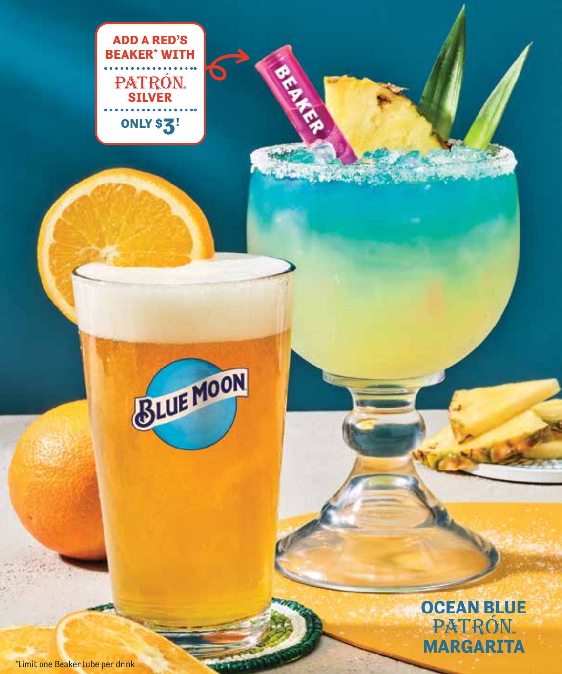
OCEAN BLUE PATRÓN MARGARITA

ADD A RED'S BEAKER* WITH PATRÓN. SILVER ..... ONLY $3!