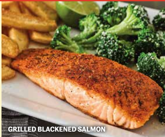
GRILLED BLACKENED SALMON

★ GRILLED BLACKENED SALMON Rich in flavor, our Atlantic salmon filet comes seasoned in Cajun spices and grilled to perfection. Served with garlic Parmesan broccoli and your choice of Bottomless side. (cal. 320-880) | 22.29