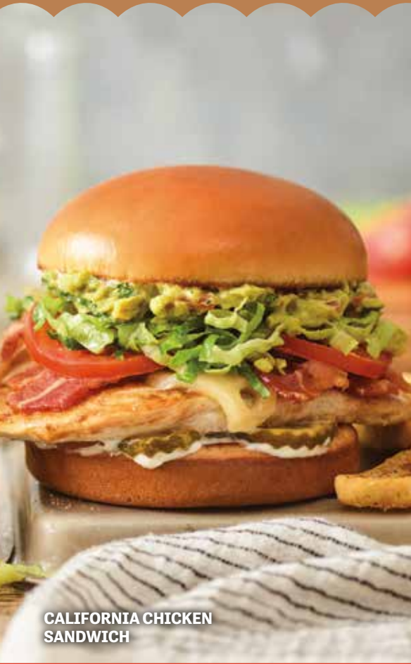
CALIFORNIA CHICKEN SANDWICH