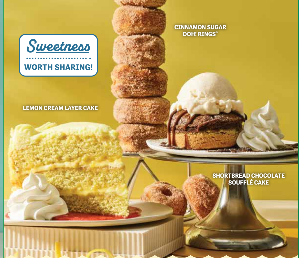
LEMON CREAM LAYER CAKE