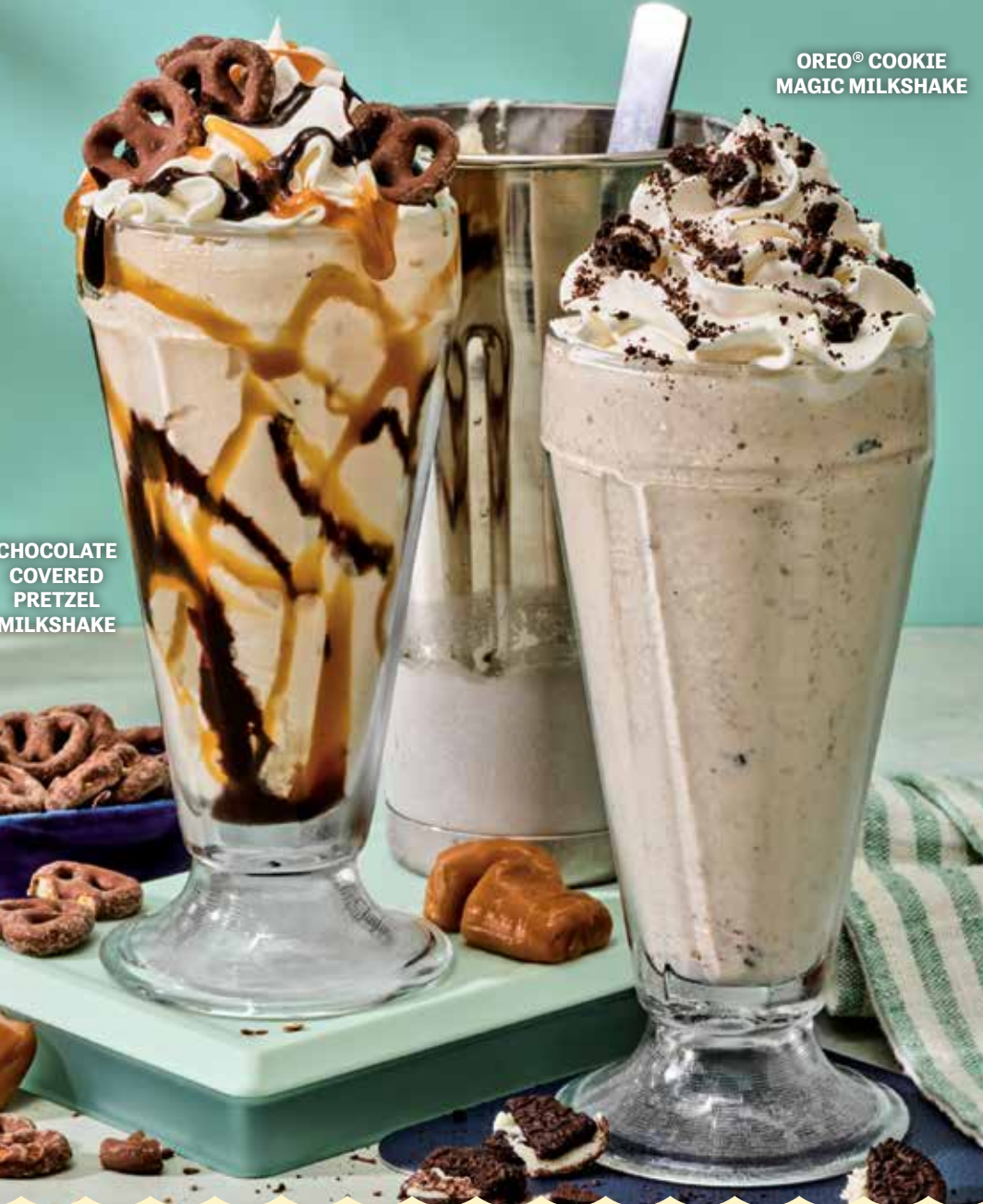
CHOCOLATE COVERED PRETZEL MILKSHAKE