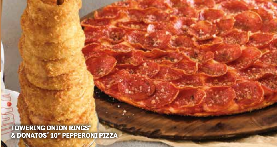
TOWERING ONION RINGS® & DONATOS® 10" PEPPERONI PIZZA

2,000 calories a day is used for general nutrition advice, but calorie needs vary. Additional nutrition information available upon request. All calorie counts are for the burger/entrée only and do not include a side unless otherwise noted in the description. *Burger, Sandwich or Entrée. †Does not include calories for dressing: 2 oz. (cal. 90–350) served with House Salad and Side Salad. 3 oz. (cal. 140–520) served with all other Entrée Salads.‡Does not include calories for sauce. RRGB-T9-DONTST_0325