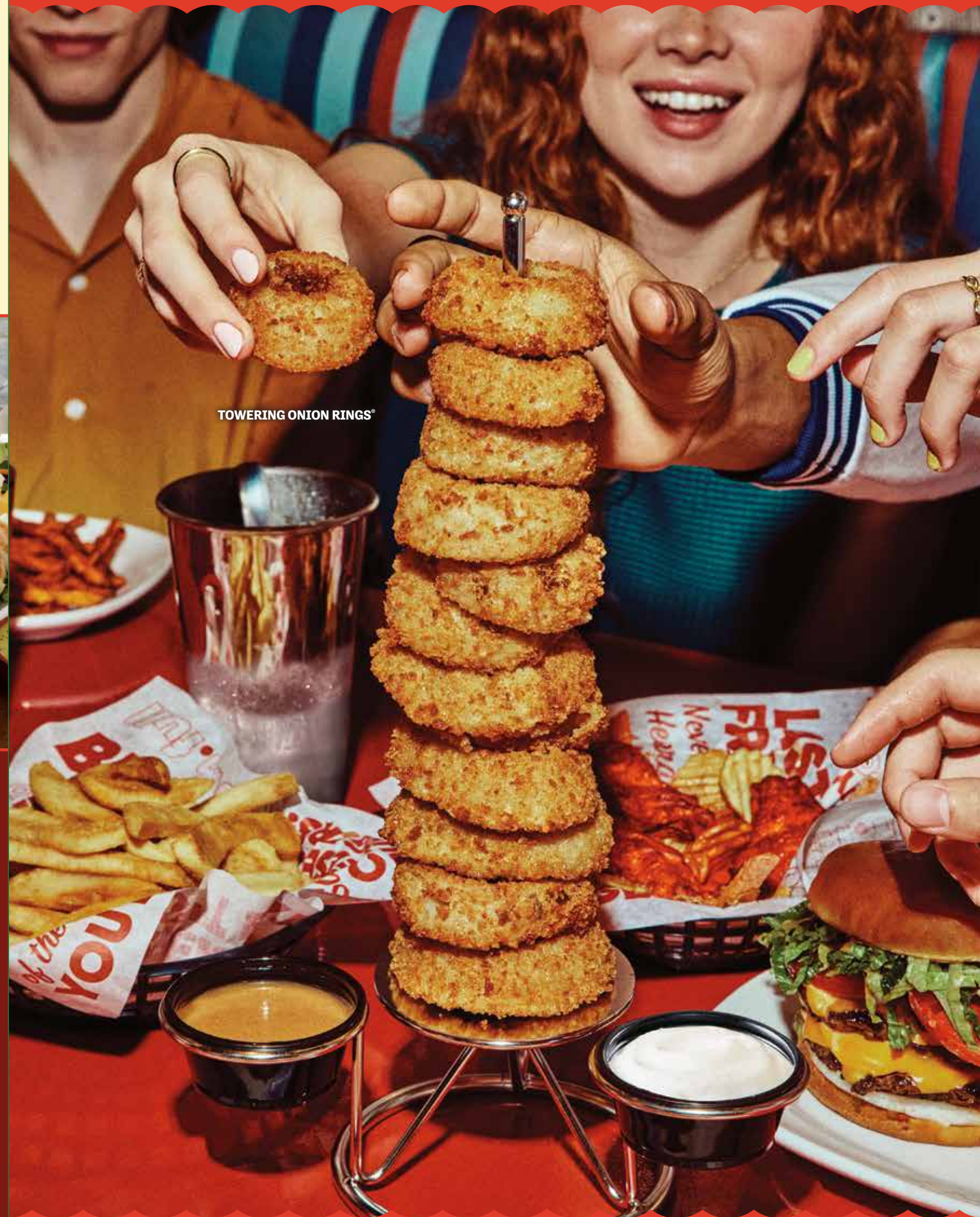
TOWERING ONION RINGS®