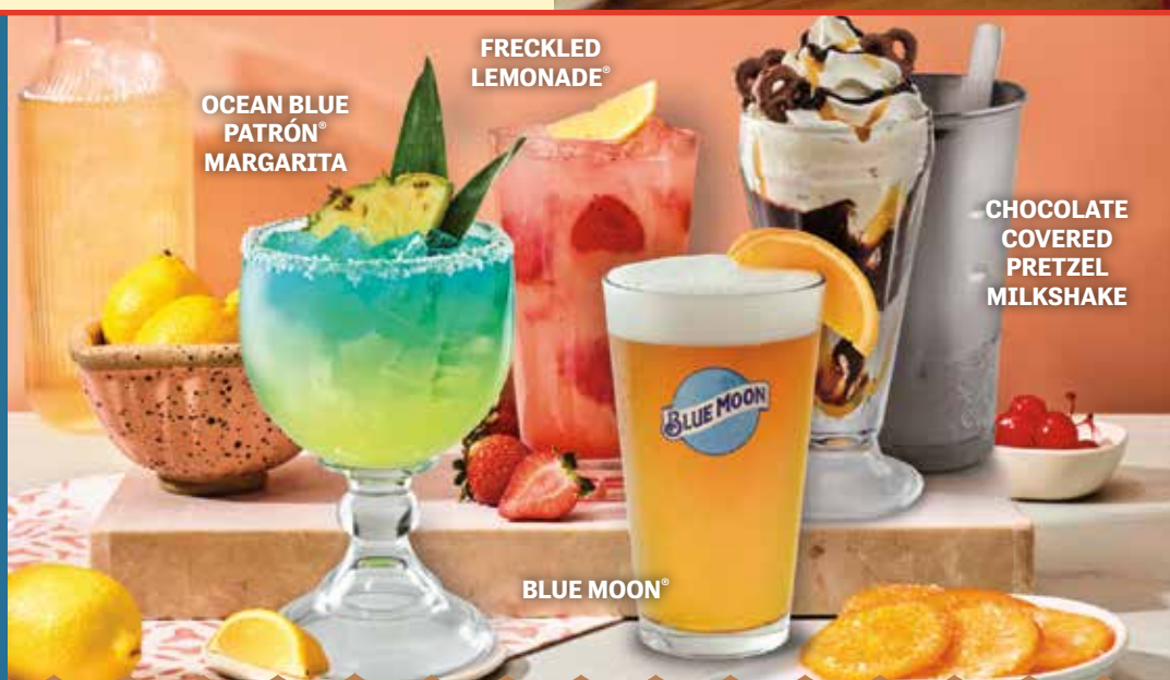
OCEAN BLUE PATRÓN® MARGARITA