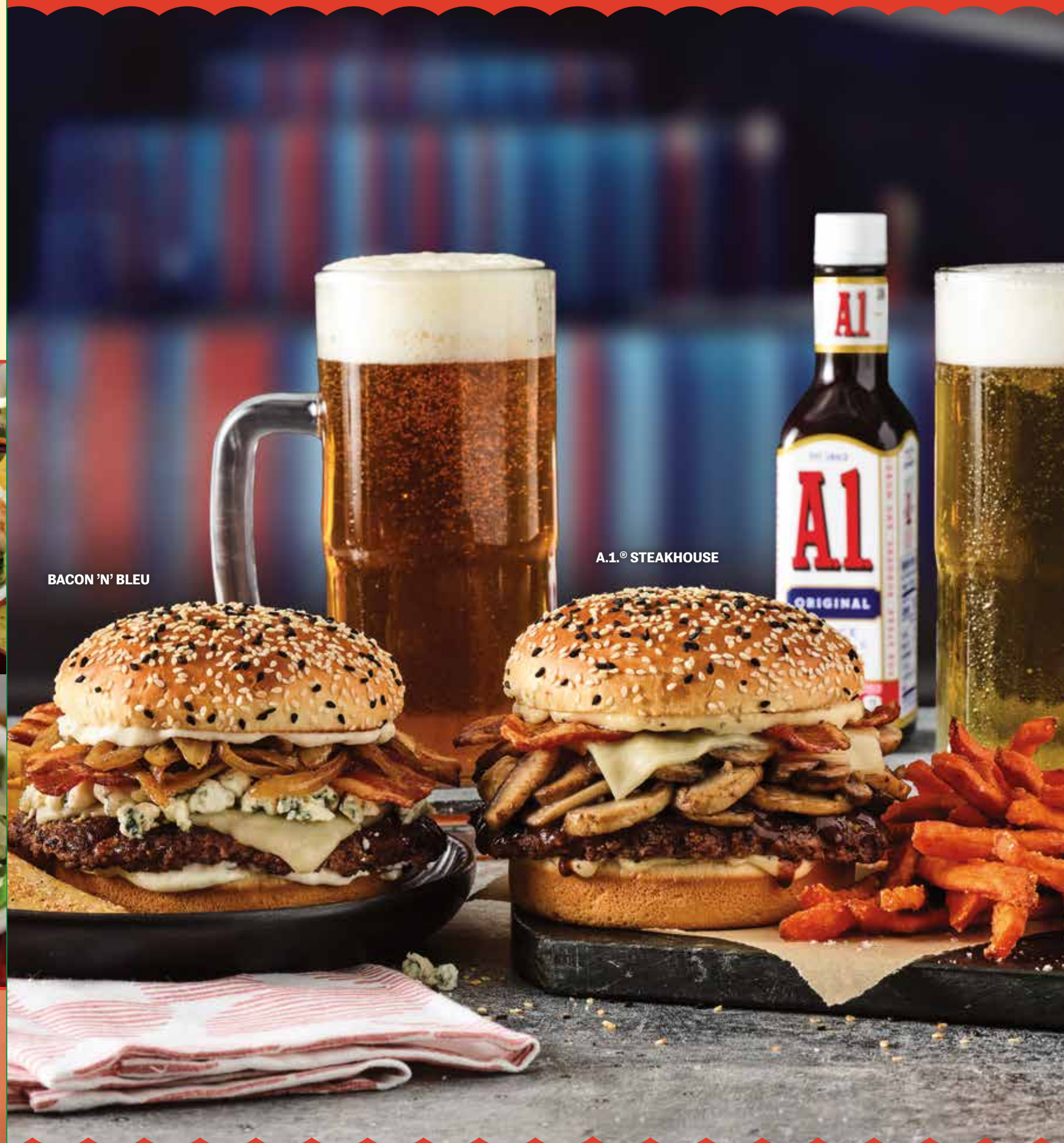
BACON 'N' BLEU