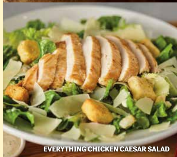
EVERYTHING CHICKEN CAESAR SALAD