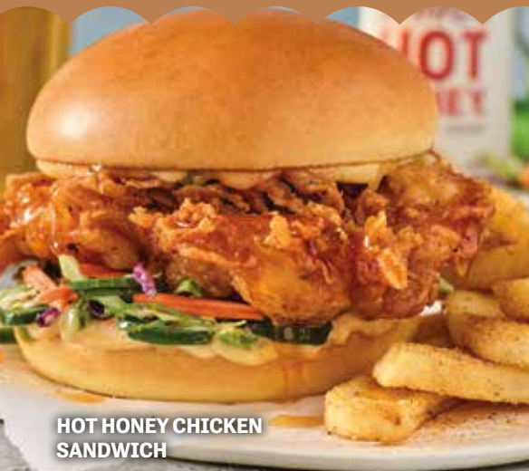
HOT HONEY CHICKEN SANDWICH