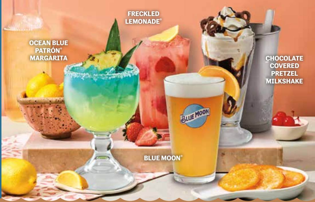
OCEAN BLUE PATRÓN® MARGARITA