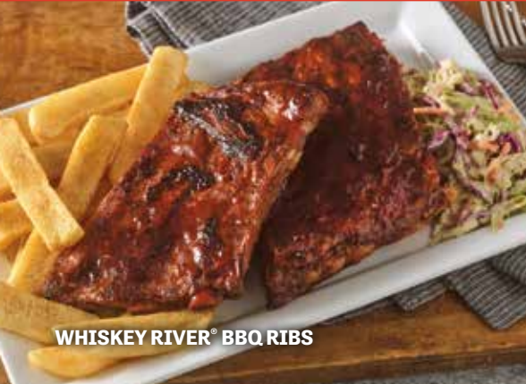
WHISKEY RIVER® BBQ RIBS

Can't decide on just one flavor? Get two flavors in the same order!