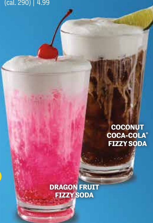
DRAGON FRUIT FIZZY SODA

LEMONY ICED TEA Half iced tea and half Minute Maid® Lemonade. (cal. 70) | 3.99