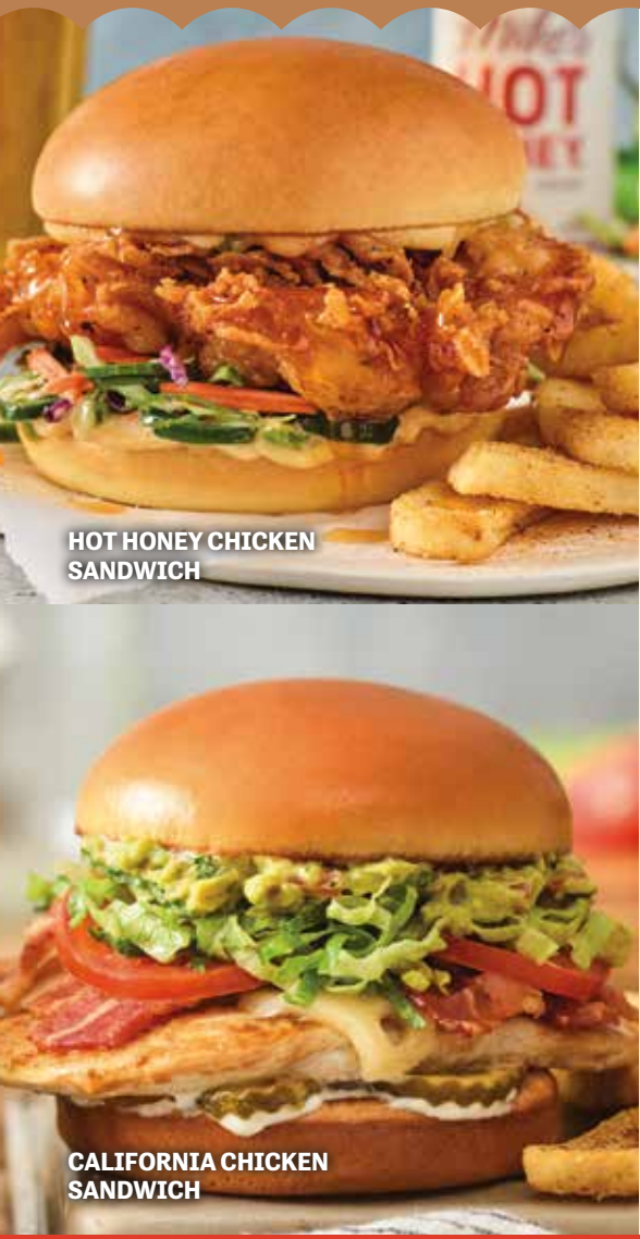
HOT HONEY CHICKEN SANDWICH