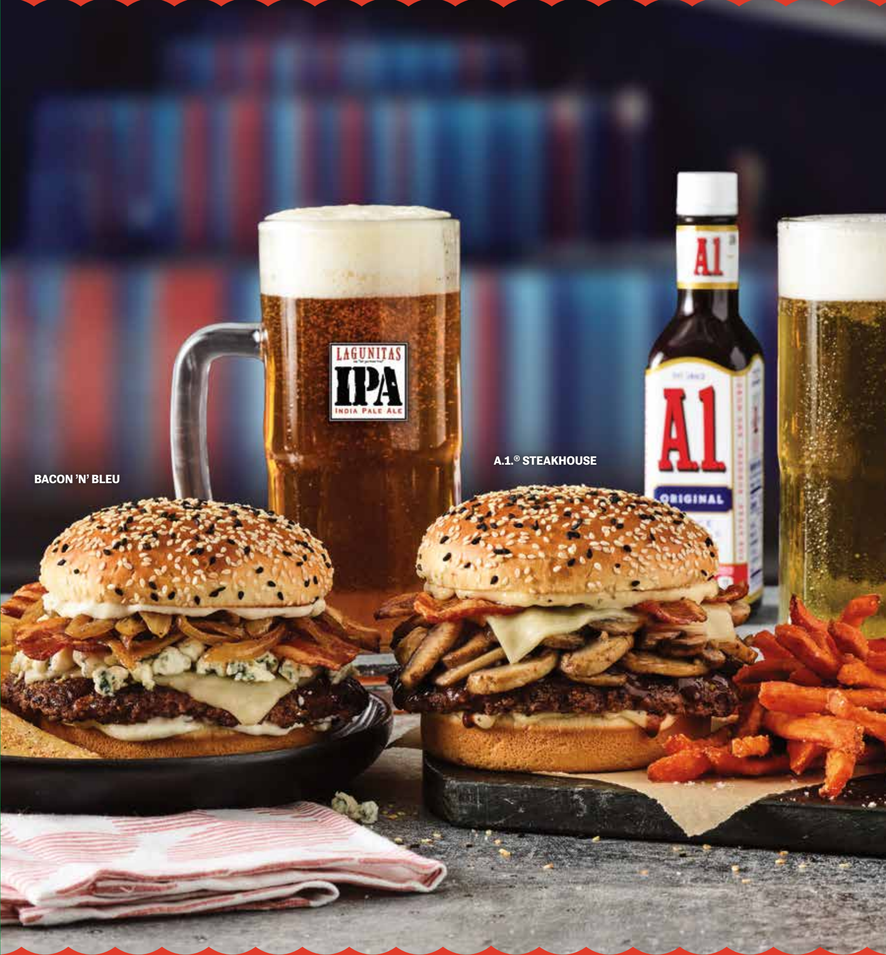
BACON 'N' BLEU