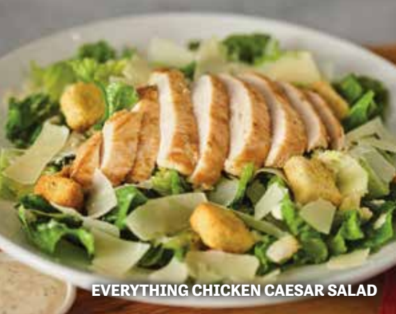
EVERYTHING CHICKEN CAESAR SALAD