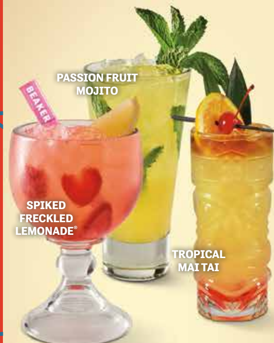
SPIKED FRECKLED LEMONADE®

🌶️ SAND IN YOUR SHORTS® Vodka, peach schnapps, triple sec, orange and cranberry juices, raspberry and all-natural sweet & sour. (cal. 300)