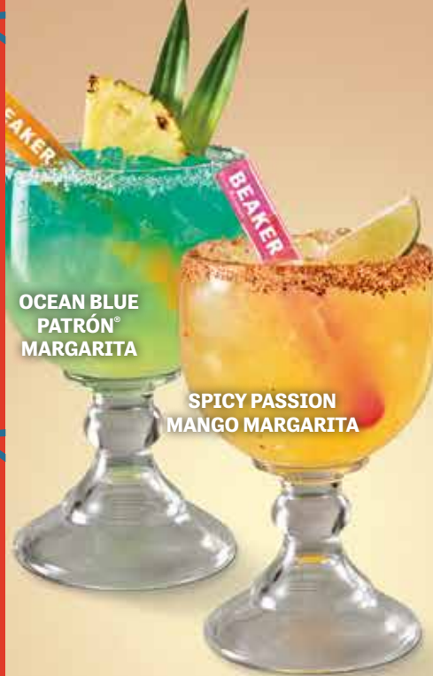
OCEAN BLUE PATRÓN® MARGARITA