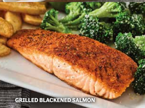
GRILLED BLACKENED SALMON