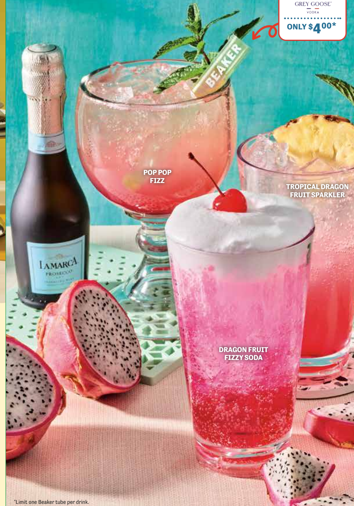
POP POP FIZZ