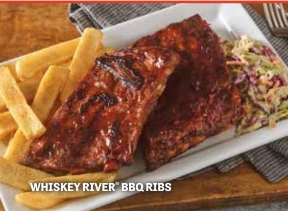
WHISKEY RIVER® BBQ RIBS

Crispy panko-breaded shrimp served with cocktail sauce, garlic-Parmesan broccoli and your choice of Bottomless side. (cal. 750-1210) | 20.49