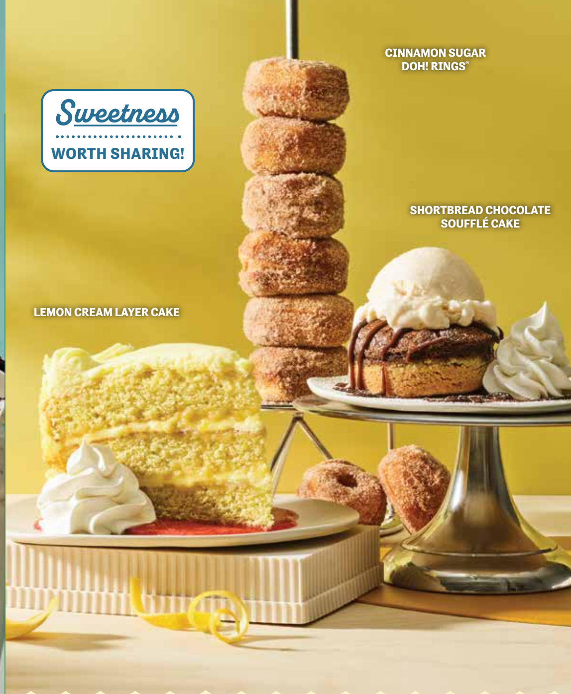
CINNAMON SUGAR DOH! RINGS®