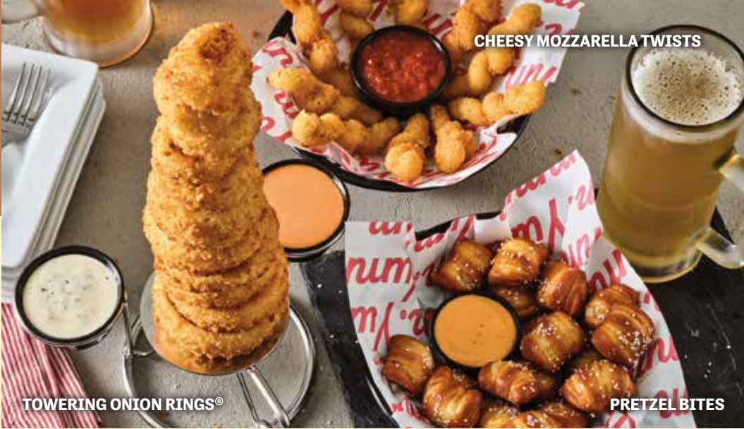
TOWERING ONION RINGS®

PRETZEL BITES The perfect pairing of salty, soft pretzels and New Belgium Fat Tire® beer cheese. (cal. 780) | 9.79 Get it with a side of Mike's Hot Honey®. (cal. 190) | 1.79