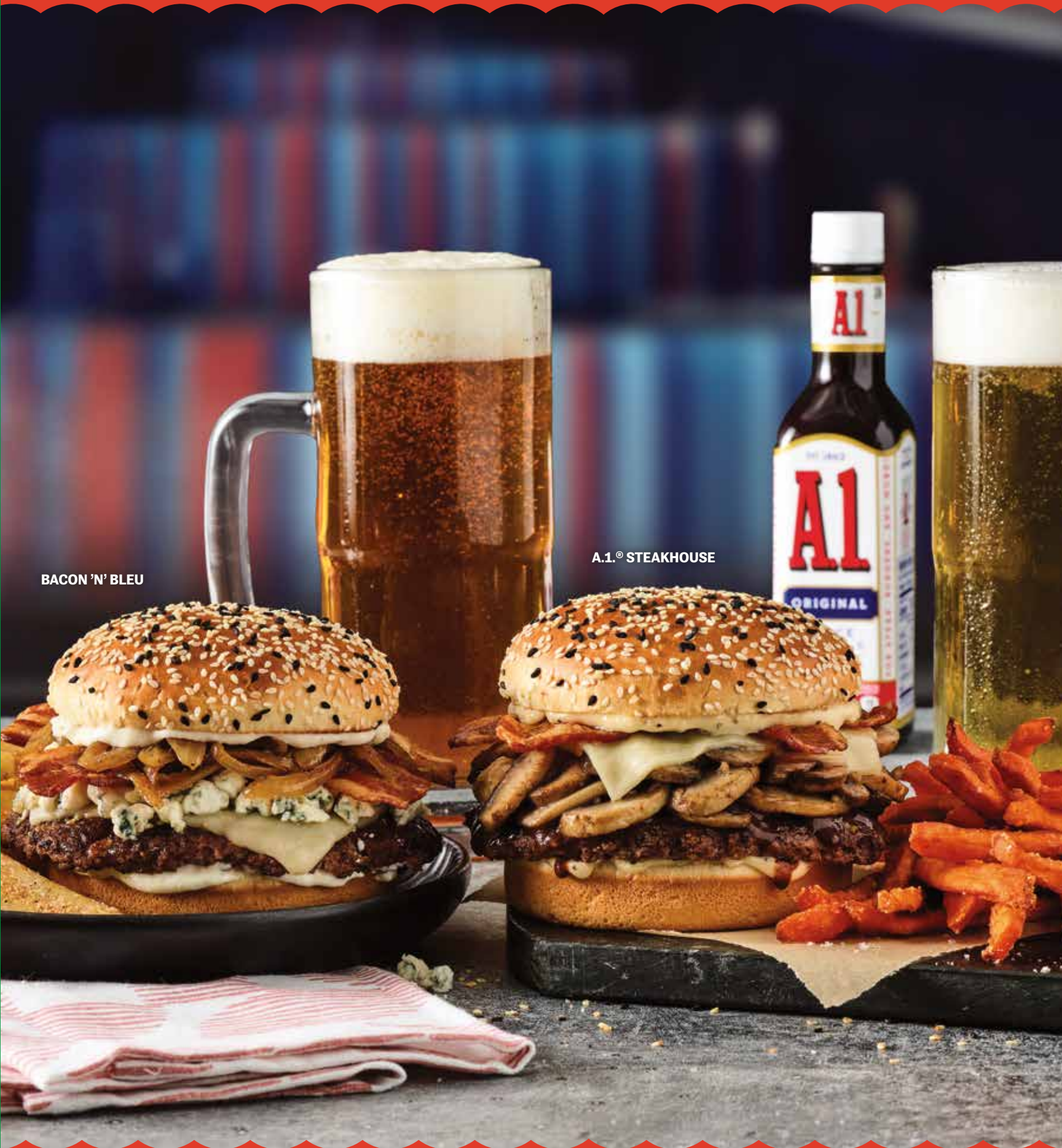
BACON 'N' BLEU