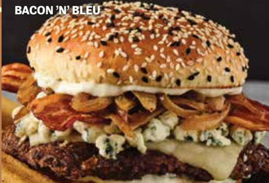
BACON 'N' BLEU

ADD AN EXTRA BURGER PATTY FOR 4.99 (CAL. 340)