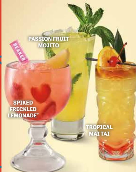
SPIKED FRECKLED LEMONADE®

🌶️ SAND IN YOUR SHORTS® Vodka, peach schnapps, triple sec, orange and cranberry juices, raspberry and all-natural sweet & sour. (cal. 300)