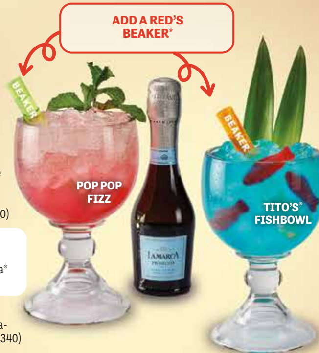
ADD A RED'S BEAKER®

SPICY PASSION MANGO MARGARITA 🌶️ Milagro® Reposado, Cointreau®, agave and lime shaken with a kick of jalapeño and sweet flavors of passion fruit and mango. Garnished with a Tajín® rim. (cal. 370)