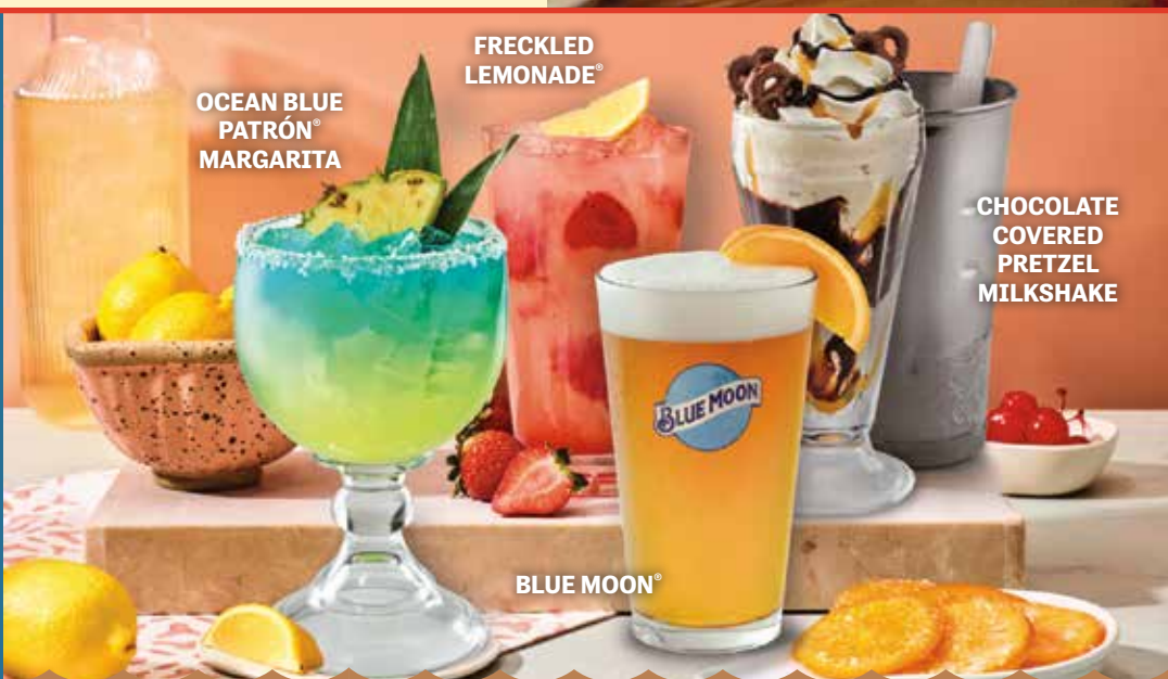
OCEAN BLUE PATRÓN® MARGARITA

Check out our BEVERAGES & DESSERTS MENU FOR THE FULL LINEUP