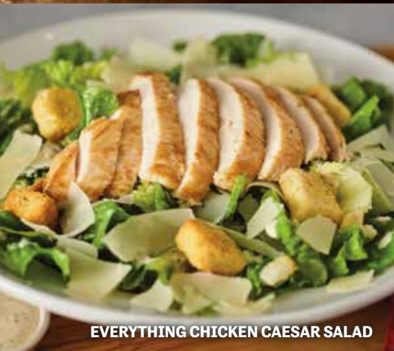
EVERYTHING CHICKEN CAESAR SALAD

Check out our BEVERAGES & DESSERTS MENU FOR THE FULL LINEUP