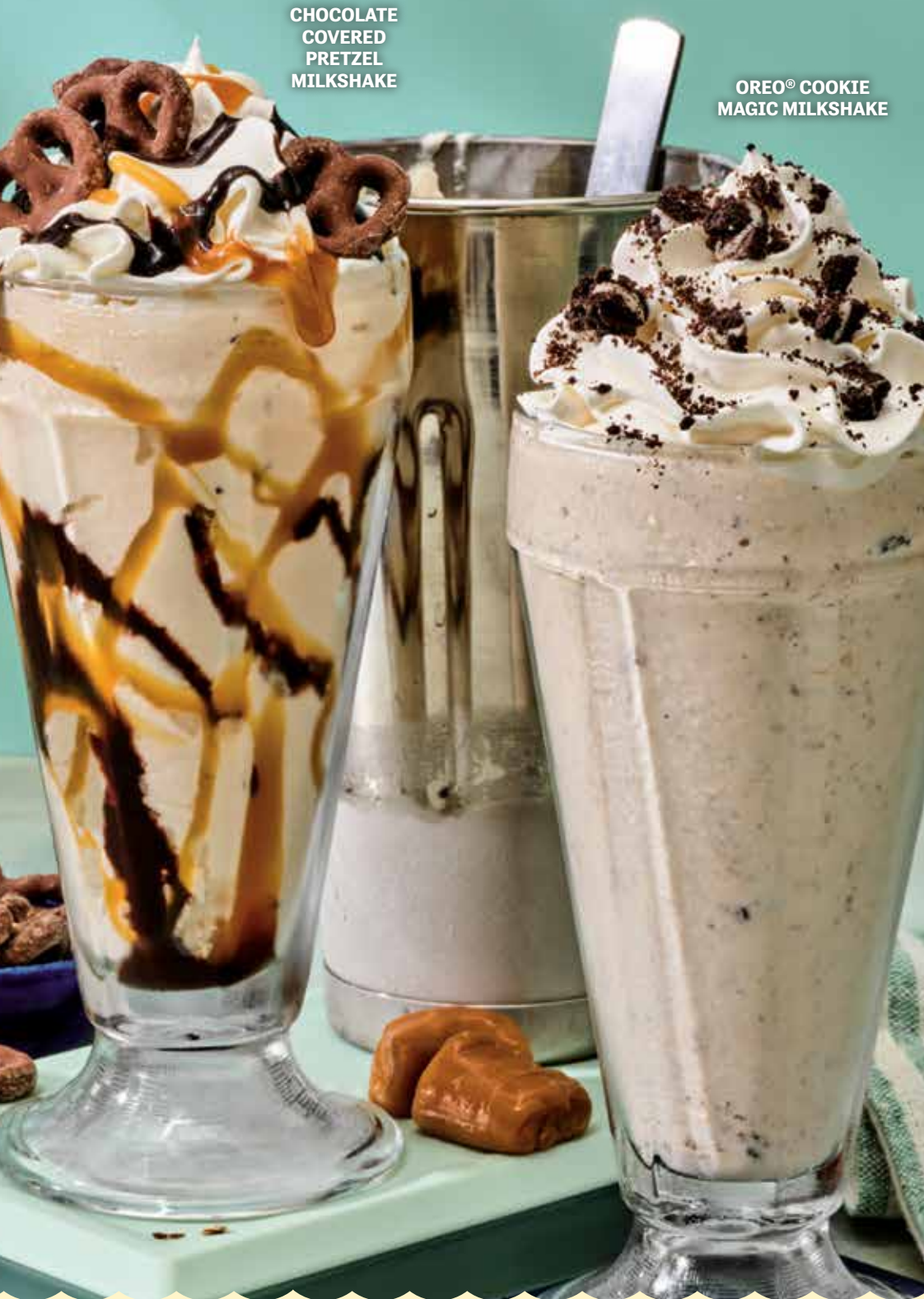
OREO® COOKIE MAGIC MILKSHAKE