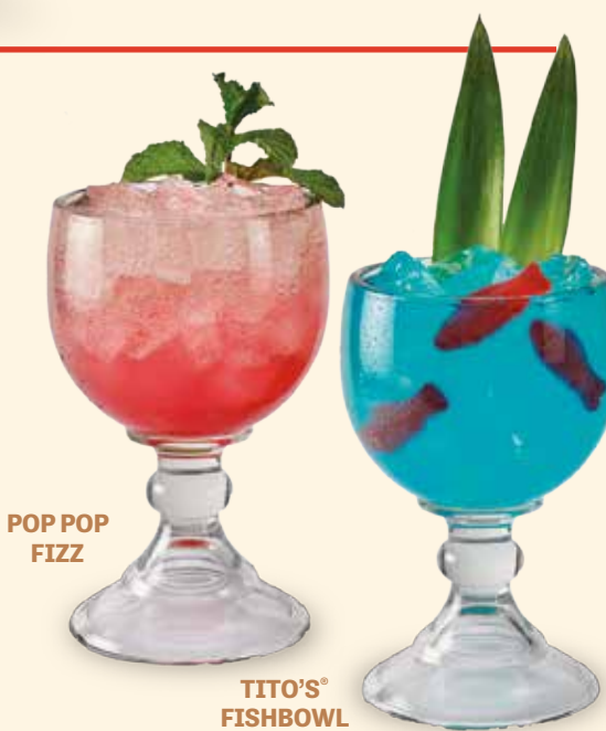
POP POP FIZZ

SPICY PASSION MANGO 🔥 Milagro® Reposado, Cointreau®, agave, lime, jalapeño, passion fruit and mango with a Tajín® rim. (cal. 370) | 10.49