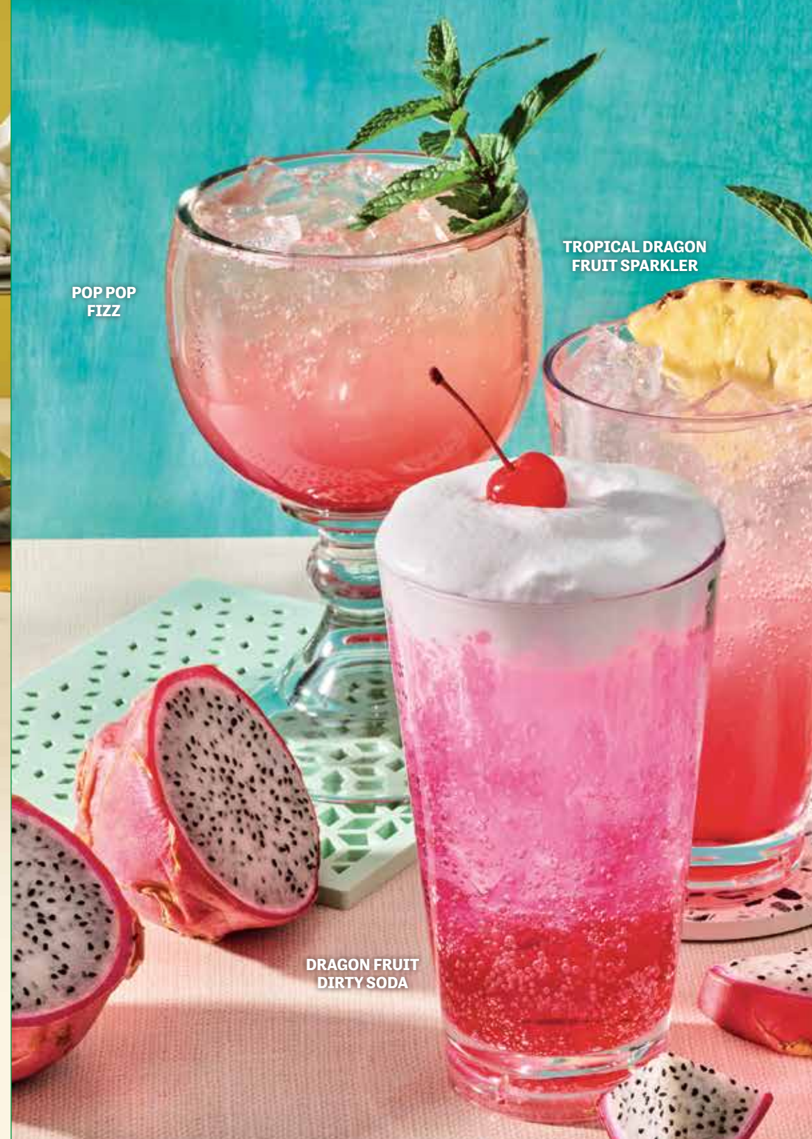
DRAGON FRUIT DIRTY SODA