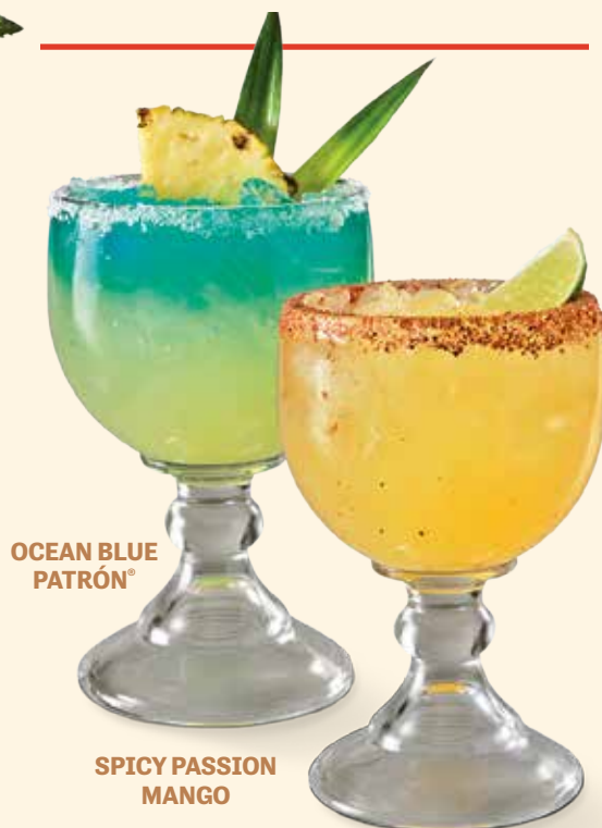
OCEAN BLUE PATRÓN*