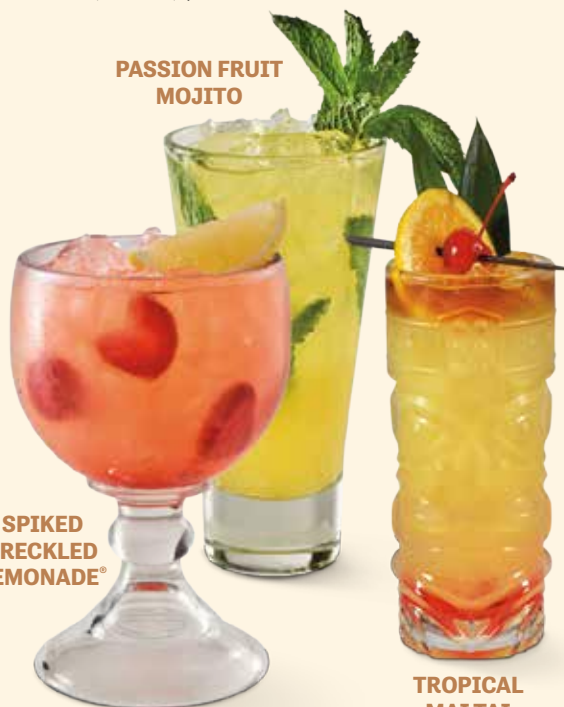
SPIKED FRECKLED LEMONADE*