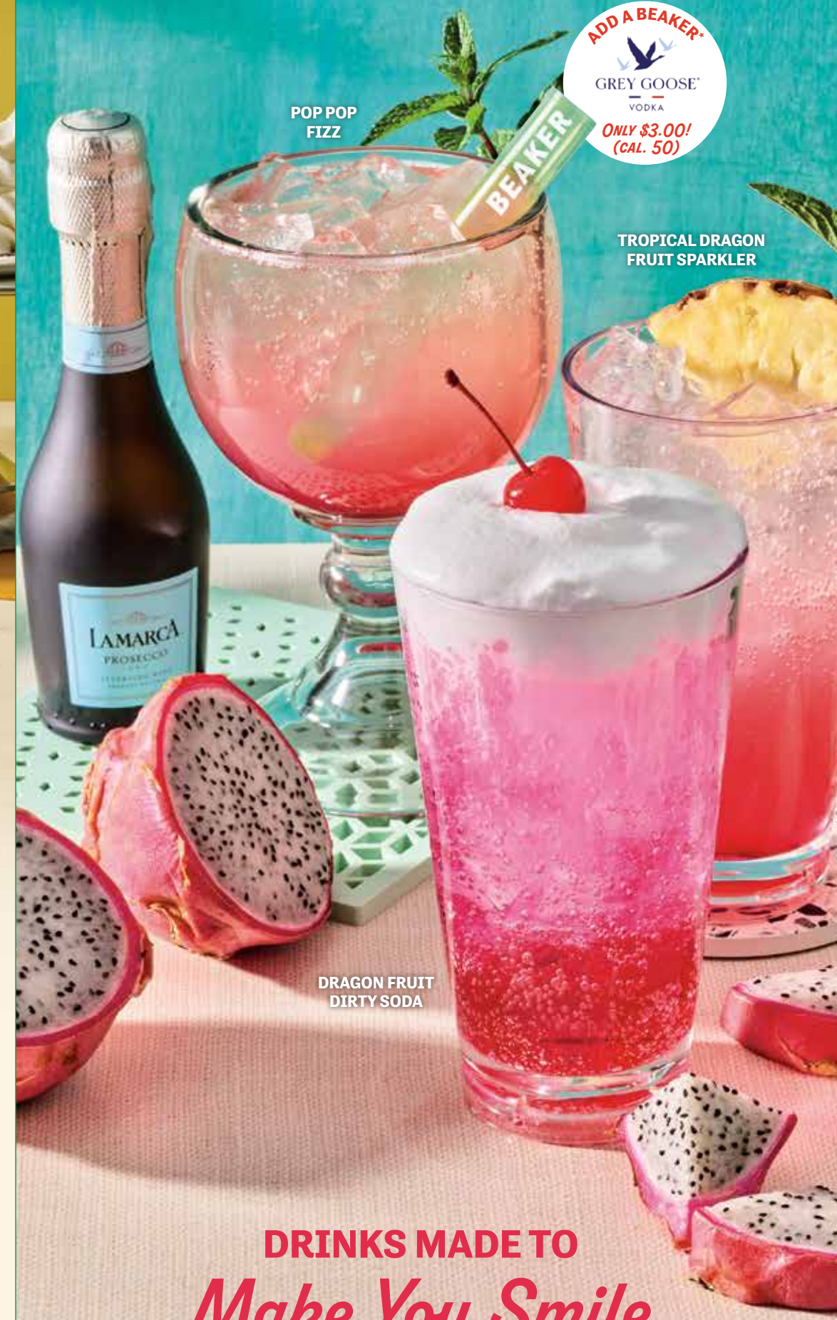
DRAGON FRUIT DIRTY SODA