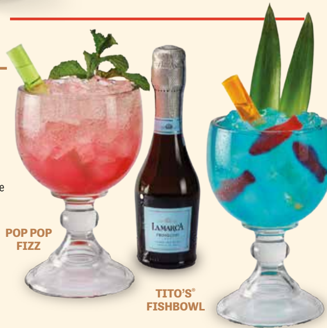
POP POP FIZZ

SAND IN YOUR SHORTS ★ Vodka, peach schnapps, triple sec, orange, cranberry, raspberry and sweet & sour. (cal. 300) | 10.99