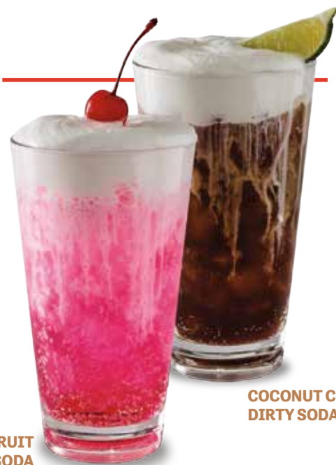
COCONUT COLA DIRTY SODA

BOTTOMLESS SOFT DRINKS (cal. 0-140) | 3.39