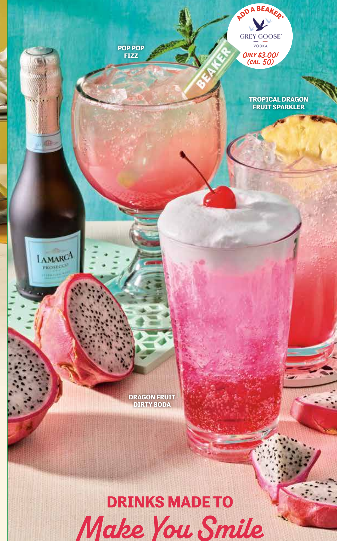
TROPICAL DRAGON FRUIT SPARKLER

ADD A BEAKER! GREY GOOSE® VODKA ONLY $3.00! (CAL. 50)