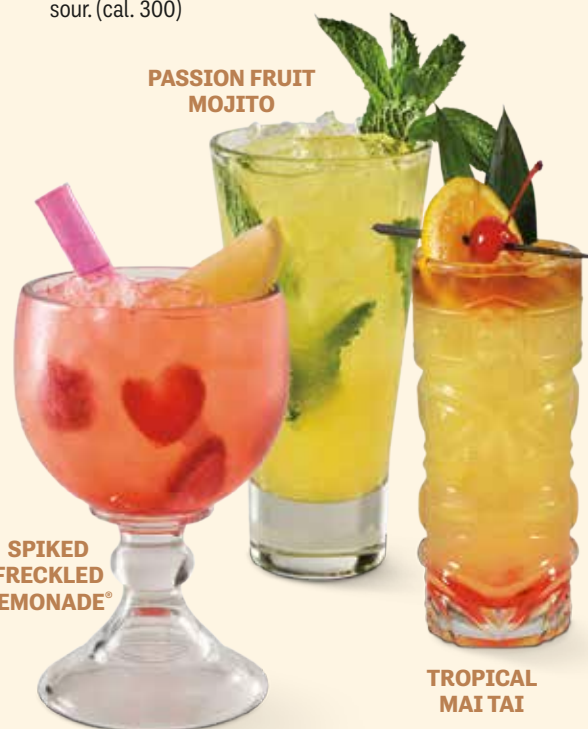
SPIKED FRECKLED LEMONADE