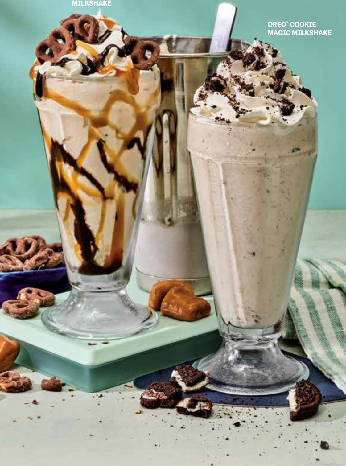
OREO® COOKIE MAGIC MILKSHAKE