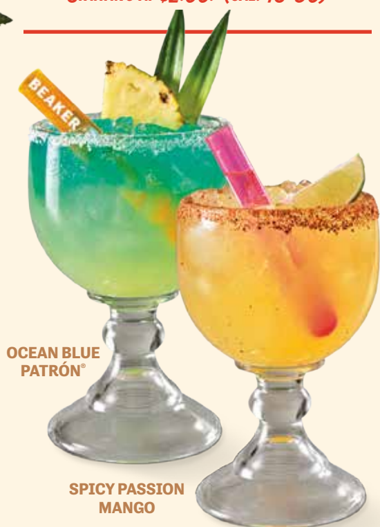
SPICY PASSION MANGO