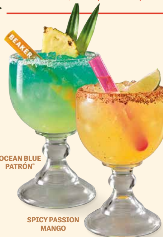
SPICY PASSION MANGO