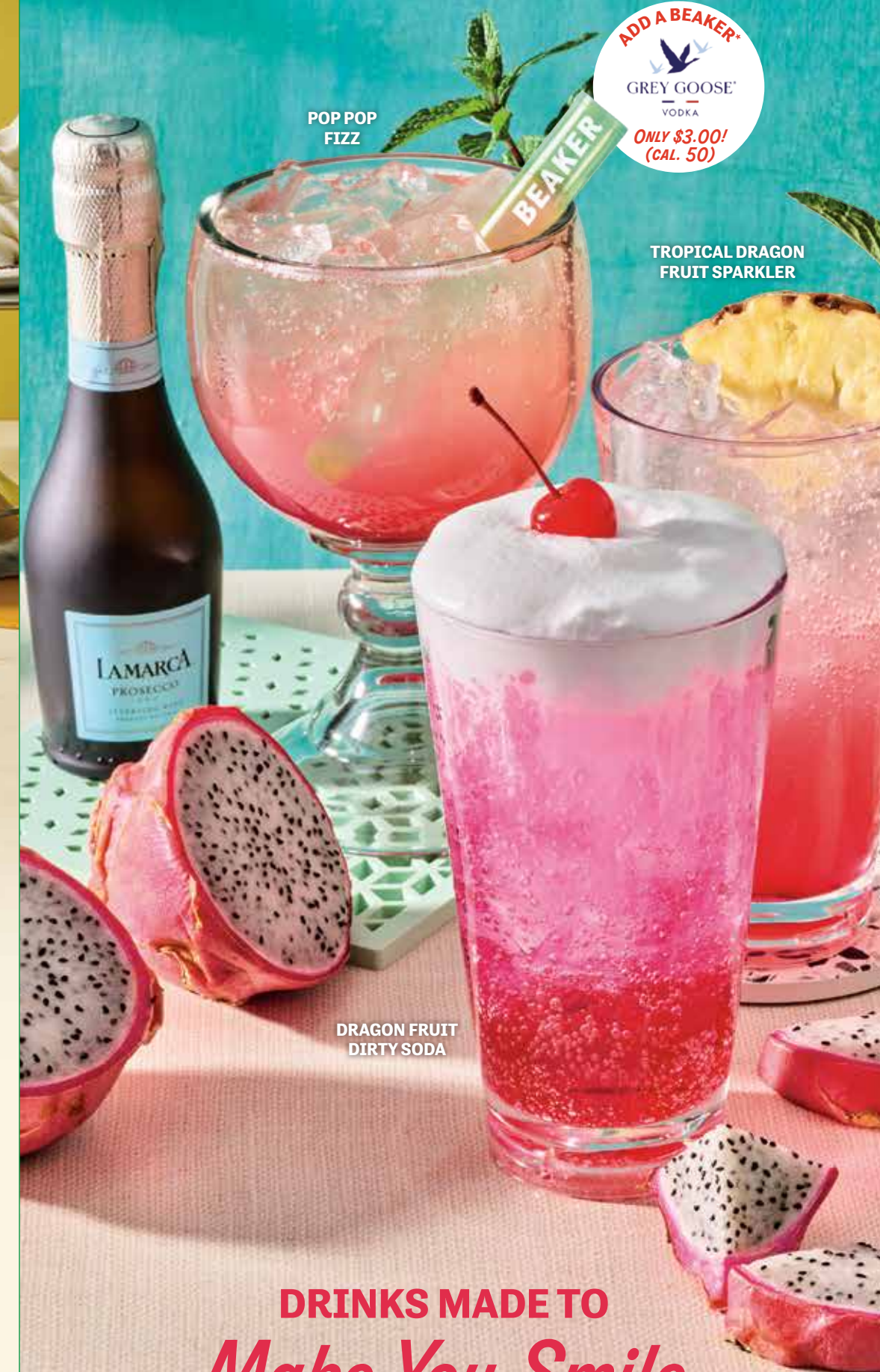
DRAGON FRUIT DIRTY SODA