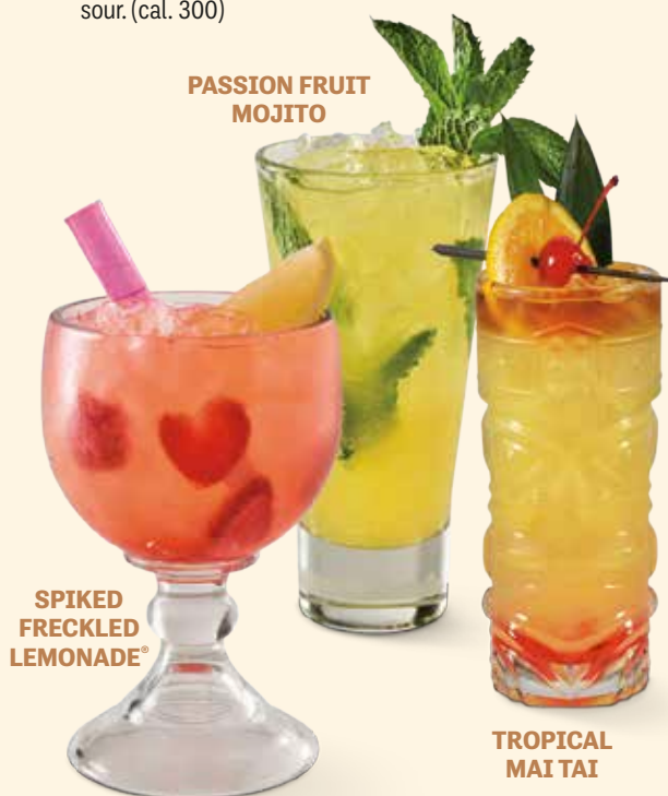
SPIKED FRECKLED LEMONADE