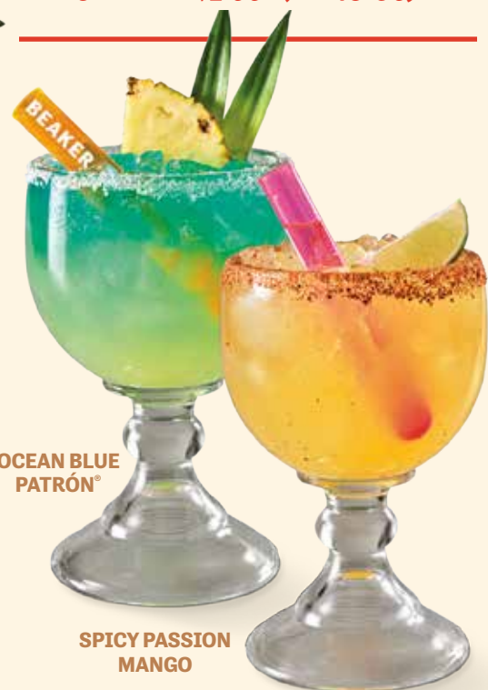
SPICY PASSION MANGO