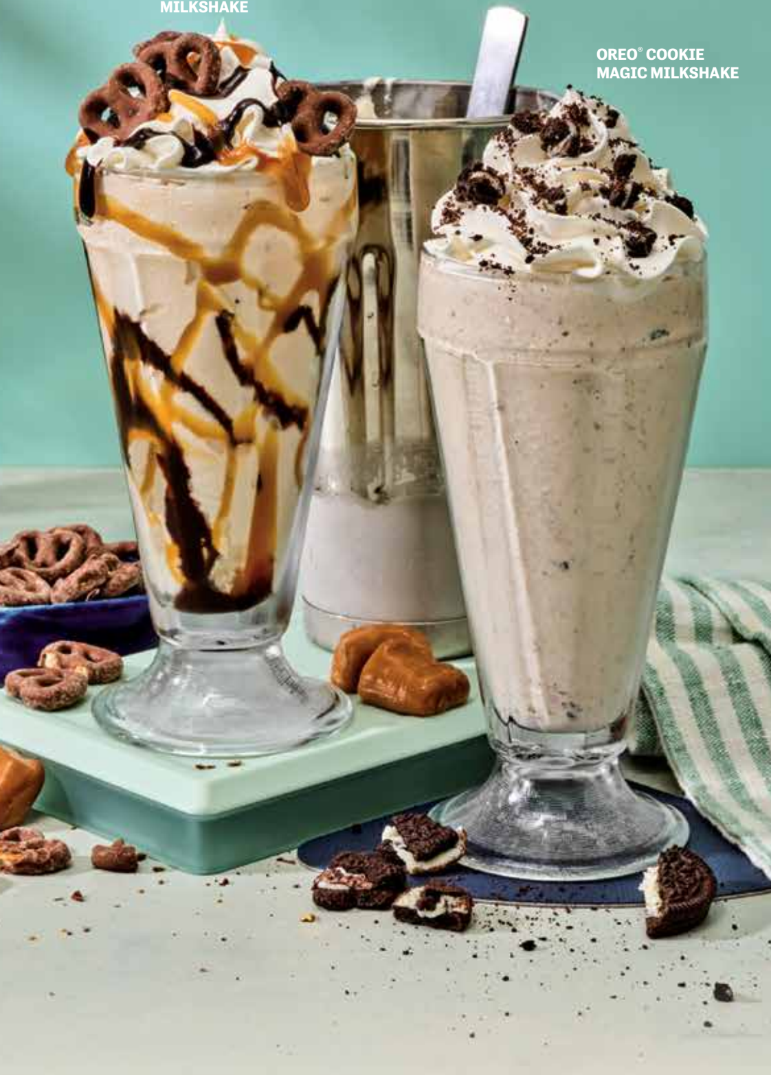
OREO® COOKIE MAGIC MILKSHAKE