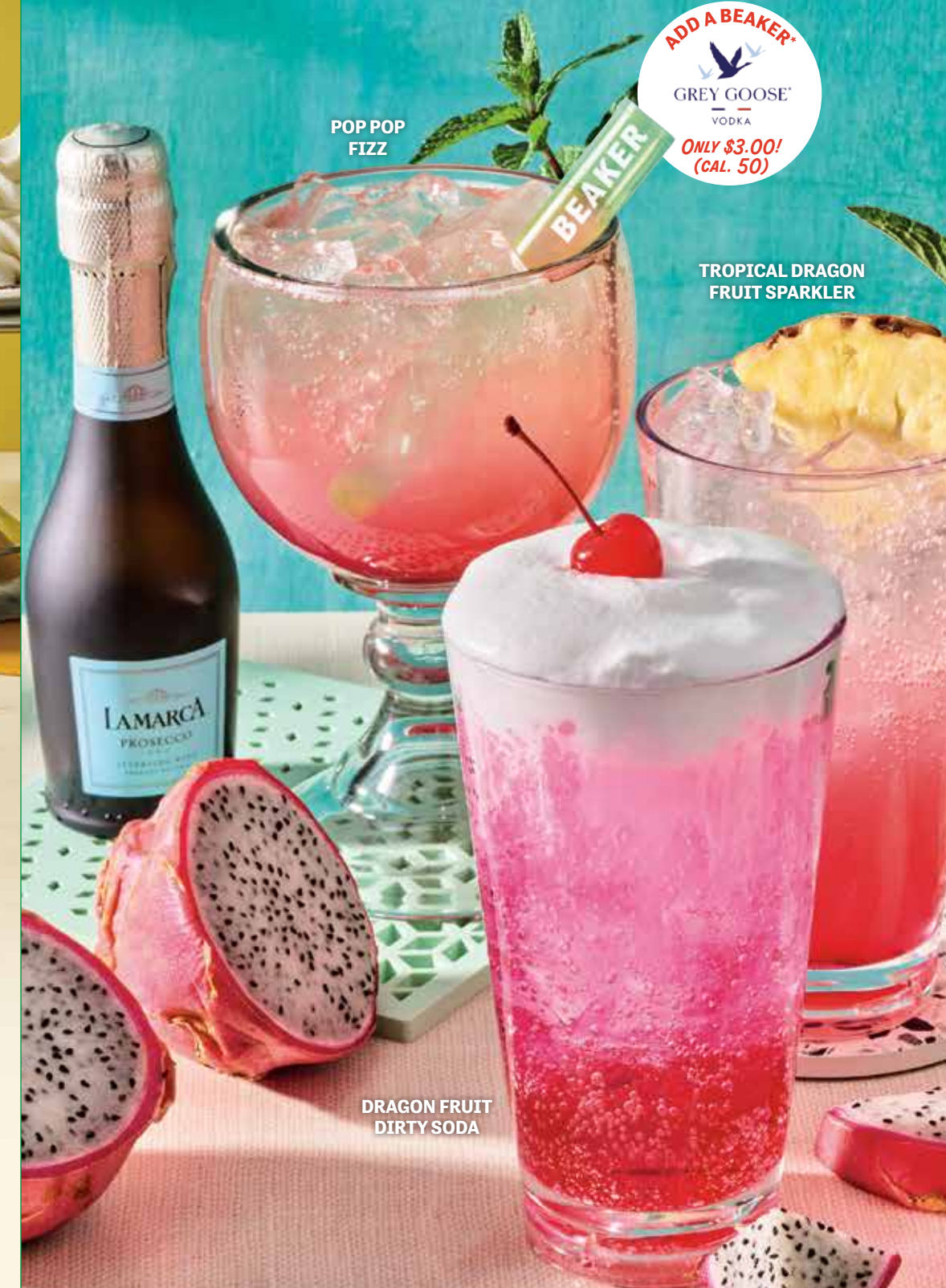
DRAGON FRUIT DIRTY SODA