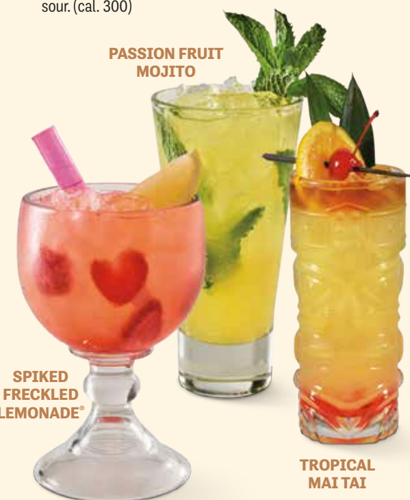
SPIKED FRECKLED LEMONADE