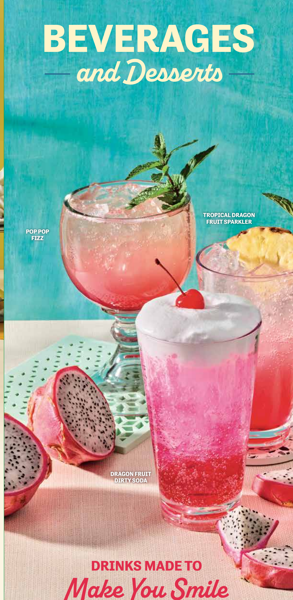
DRAGON FRUIT DIRTY SODA