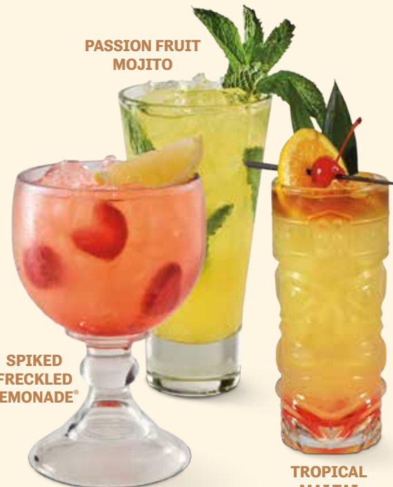
SPIKED FRECKLED LEMONADE