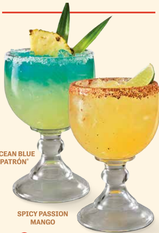
SPICY PASSION MANGO